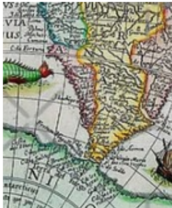
Tip of South America and the Magellan Strait

Richard Hawkins was born in 1562 and was the son of Sir John Hawkins. Sir John Hawkins was an English merchant who profited from the slave trade and was an English Navy Vice-Admiral that was victorious over the Spanish Armada. Sir John Hawkins' son, Richard Hawkins, was considered an English explorer and privateer in his own right. Initially he worked with his uncle, William Hawkins, and his father Sir John Hawkins, but eventually he bought a galleon called the Dainty in 1593. A group of three ships, the Hawk, the Fancy, and the Dainty, would proceed to sail from England towards Brazil and beyond.