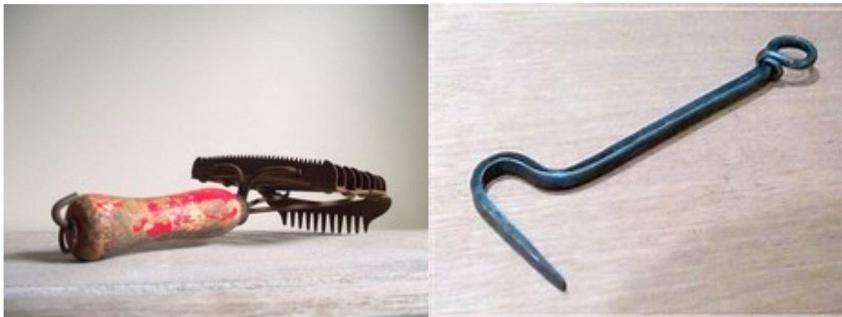
Curry Comb (left) and Hoof Pick (right)