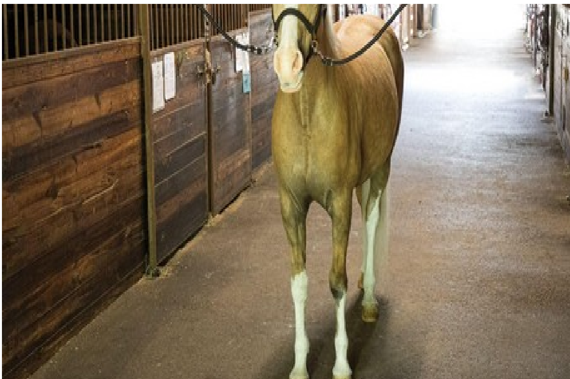
A horse wearing a halter affixed to cross ties, waiting to be groomed in a stable

Their coat will need occasional attention, as well. A curry comb is a simple tool to brush the fur on the body, taking care to follow the hair direction. Grooming is a great way to bond with a horse and also stimulates blood flow. Removing debris like dirt and stones from their feet with a hoof pick ensures better comfort and performance while preventing founder, which causes lameness. This means a horse will hobble around in pain and therefore be unsuitable for riding.