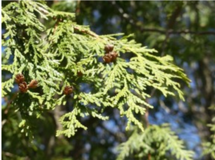
Eastern White Cedar

Lawrence River, learned from the local Iroquoians about boiling the needles of the eastern white cedar to make a tea to help those that were dying of scurvy. By 1579, the Spanish friar and physician, Agustin Farfan, published a book in which he recommended oranges and lemons for scurvy. It should be noted that scurvy had been a serious problem to many sailors that took long voyages and thousands had died over the 16 th century from the disease.