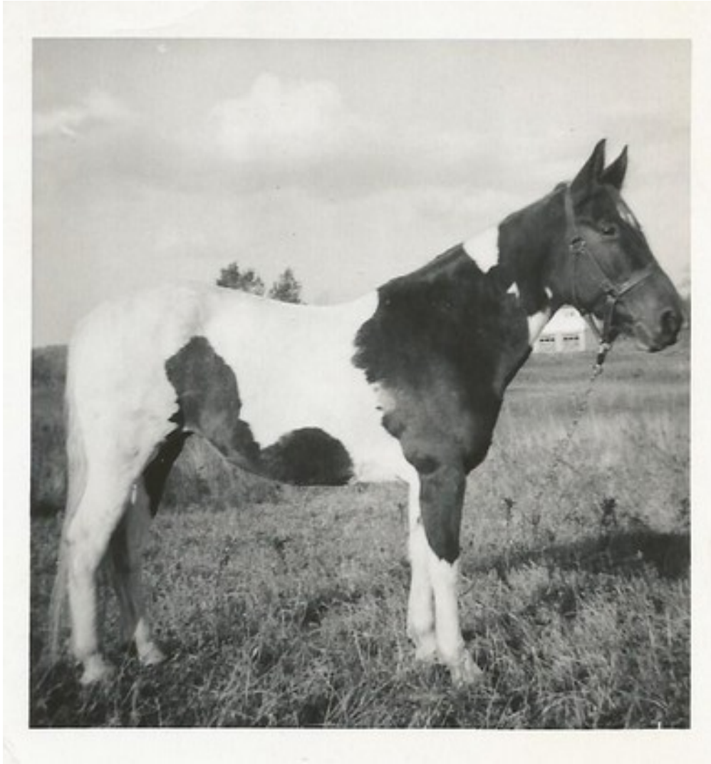
The Horse of Kinges Wood