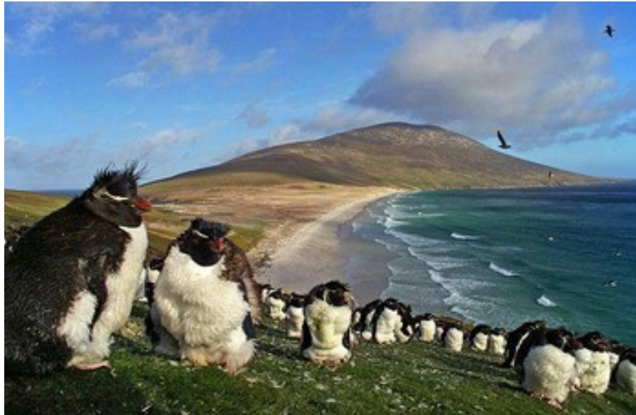
Hawkins Maiden Land ( Falkland Islands )

Soon after Richard Hawkins and the crew of the Dainty left the newly found islands to make their way through the Magellan Strait and up the western coast of South America. They eventually made their way to their destination of Valparaiso, a coastal Spanish port, to plunder it.