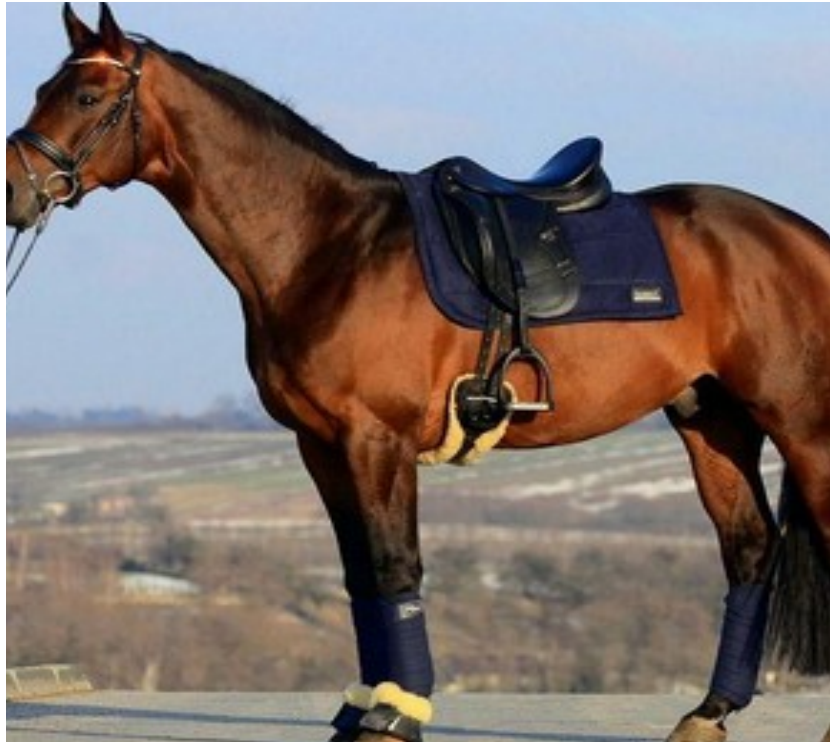
The Horse of Kinges Wood