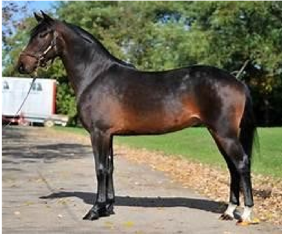
A Morgan Horse Mare