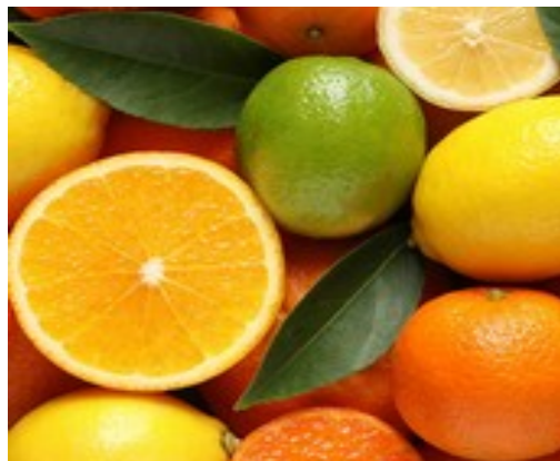
Oranges and Lemons

The second discovery Richard Hawkins noted while on this voyage was an observation about the efficacy of citrus fruits, specifically “ sower oranges and lemmons, ” for successfully treating scurvy. Richard Hawkins wrote, “ This is a wonderful secret of the power and wisdom of God, that hath hidden so great and unknown virtue in this fruit, to be a certaine remdie for this infirmitie ”. It should be noted that in the later portion of the voyage only the Dainty remained as the Hawk had been purposely sunk after several sailors died due to scurvy and the Fancy left to return to England after it got separated from the Dainty .